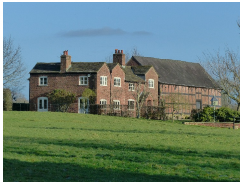
Barlow House Farmhouse and its impressive half-timbered barn are Grade II listed buildings from the early 1600s.